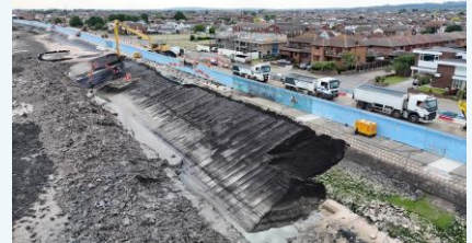
Placing LSA and laying OSA on the revetment at Chapman Sands