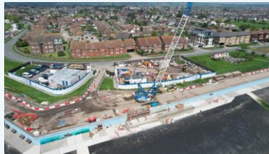
Fisherman's Corner Ramp construction work