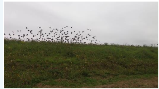
An example of the grass seed wildflower mix

The grass plays an important role in the stability of the embankment, and we must allow a good grass root growth before we can allow access to the public. Footfall on the grass will cause a delay in the grass growth which will mean the public won't be able to access the embankment for a longer period.